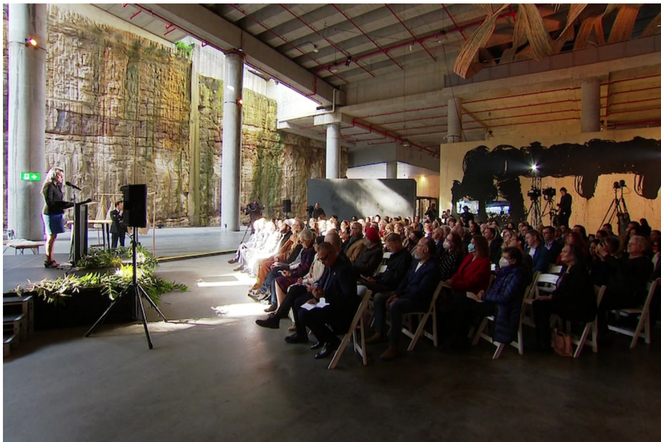
‘From the Heart and the Soul’, the Cutway Barrangaroo